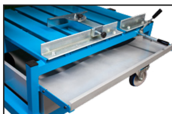
Galvanised and removable water tub, long life and easy cleaning.