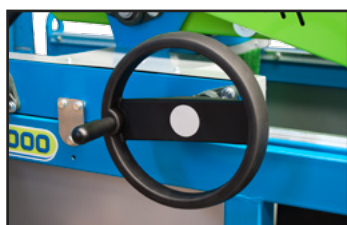
Handwheel operated mechanical feed.