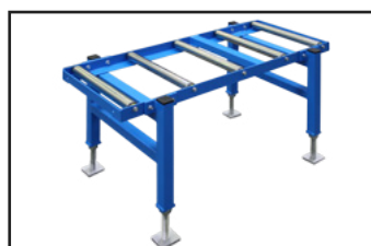
Side rolling conveyor (optional).