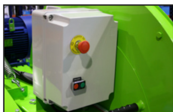
New star-delta motor starter.