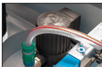
Heavy duty water pump, High flow to improve blade cooling.