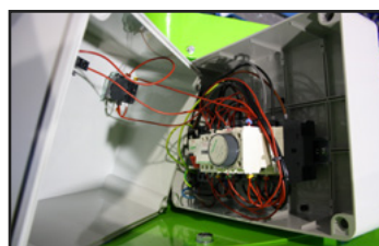
Electric components built into a high protection IP657 box.