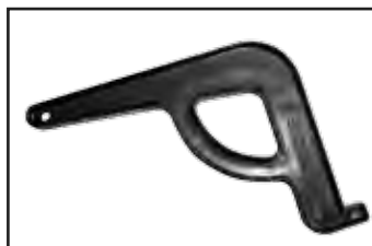
Pusher for safe cutting.