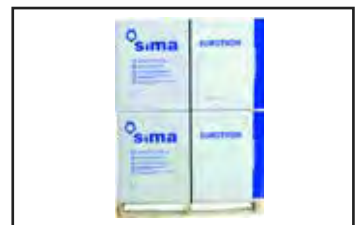
Two pieces per pallet.