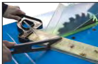
Start up and cutting with a pusher.