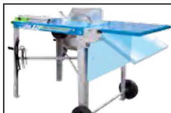
Extension support table (Standard).