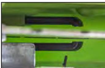
Water cooling fork, reaching both blade sides.