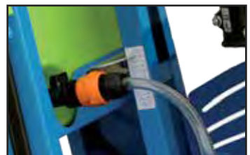
Cutting depth indicator.