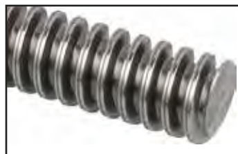
Cutting depth operated by trapezoidal thread shaft.