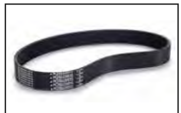
Poly-V belt transmission (Yanmar).