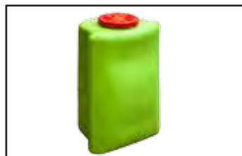
40 or 50 litres water tank (model COBRA 40 or COBRA 50 respectively).