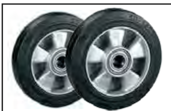
Rubber band wheels with ball bearings.