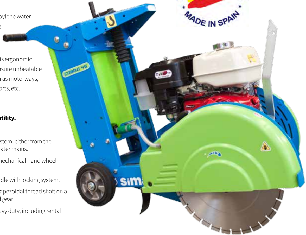
COBRA 45 HONDA