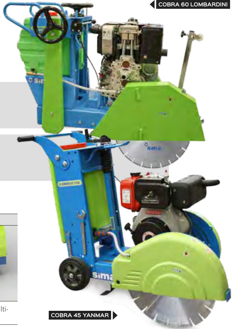
COBRA 60 LOMBARDINI