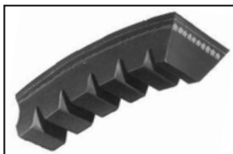
Trapezoidal transmission belts (Honda and Lombardini).