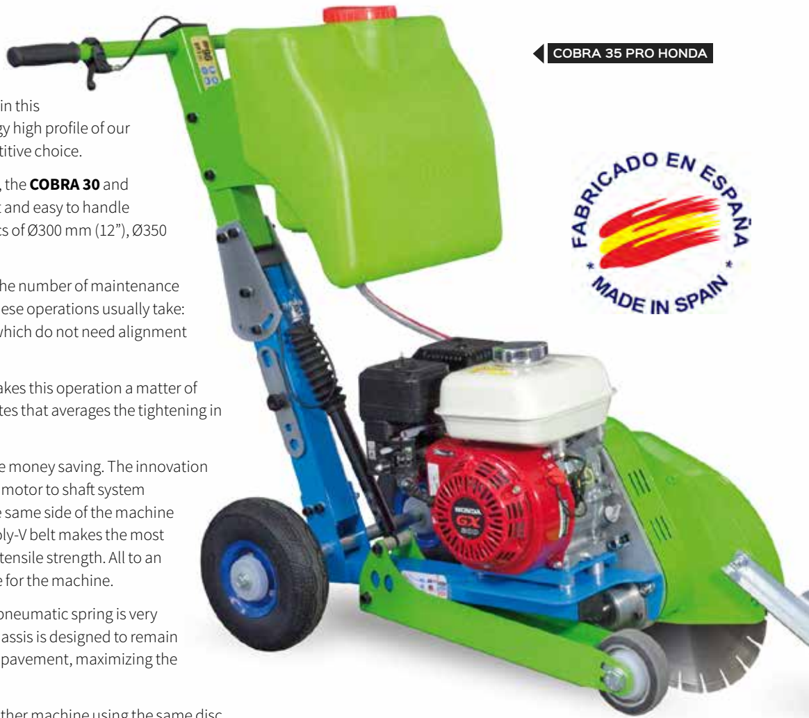
◀ COBRA 35 PRO HONDA

These COBRAS cut more than any other machine using the same disc diameter.