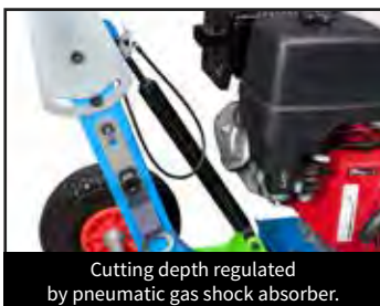
Cutting depth regulated by pneumatic gas shock absorber.