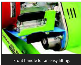
Front handle for an easy lifting.