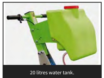
20 litres water tank.