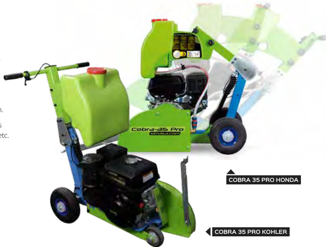
COBRA 35 PRO HONDA