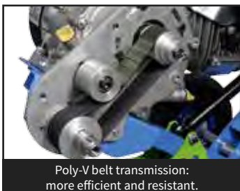
Poly-V belt transmission: more efficient and resistant.