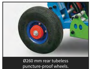
Ø260 mm rear tubeless puncture-proof wheels.