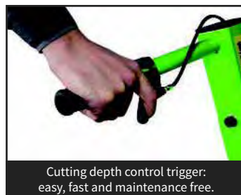
Cutting depth control trigger: easy, fast and maintenance free.