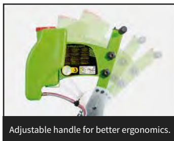
Adjustable handle for better ergonomics.